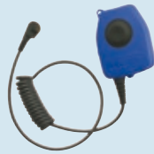
Peltor headset adapter