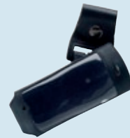
Leather case with clip